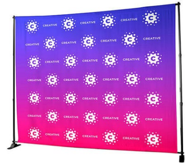
Step & Repeat Banner